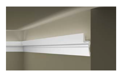
IL9 MEMORY ARSTYL®