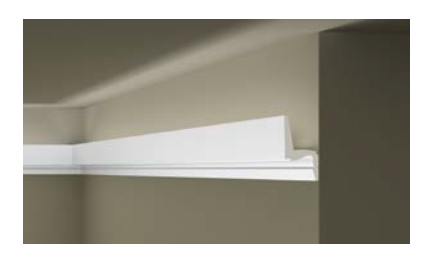
IL7 MEMORY ARSTYL®