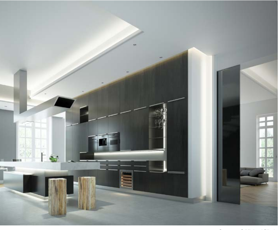
Concept: © Michael Bihain

The new mouldings from Belgian designer Michaël Bihain are pared-down, linear and perfectly proportioned, and thanks to a small groove at the back, they can also be fitted with LED strips, meaning that they can be used independently or as indirect lighting solutions.