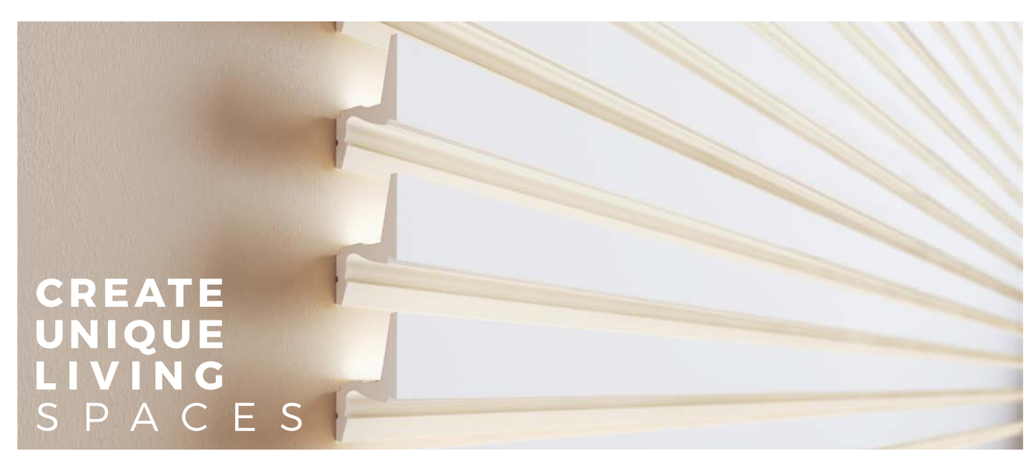
IL7 (ARSTYL®) with memory effect

The memory-effect mouldings, which integrate pre-existing mouldings into the new ones, can be charmingly integrated into a host of design worlds – either to add a touch of lightness to a classic look, or to give a traditional touch to a minimalistic interior.